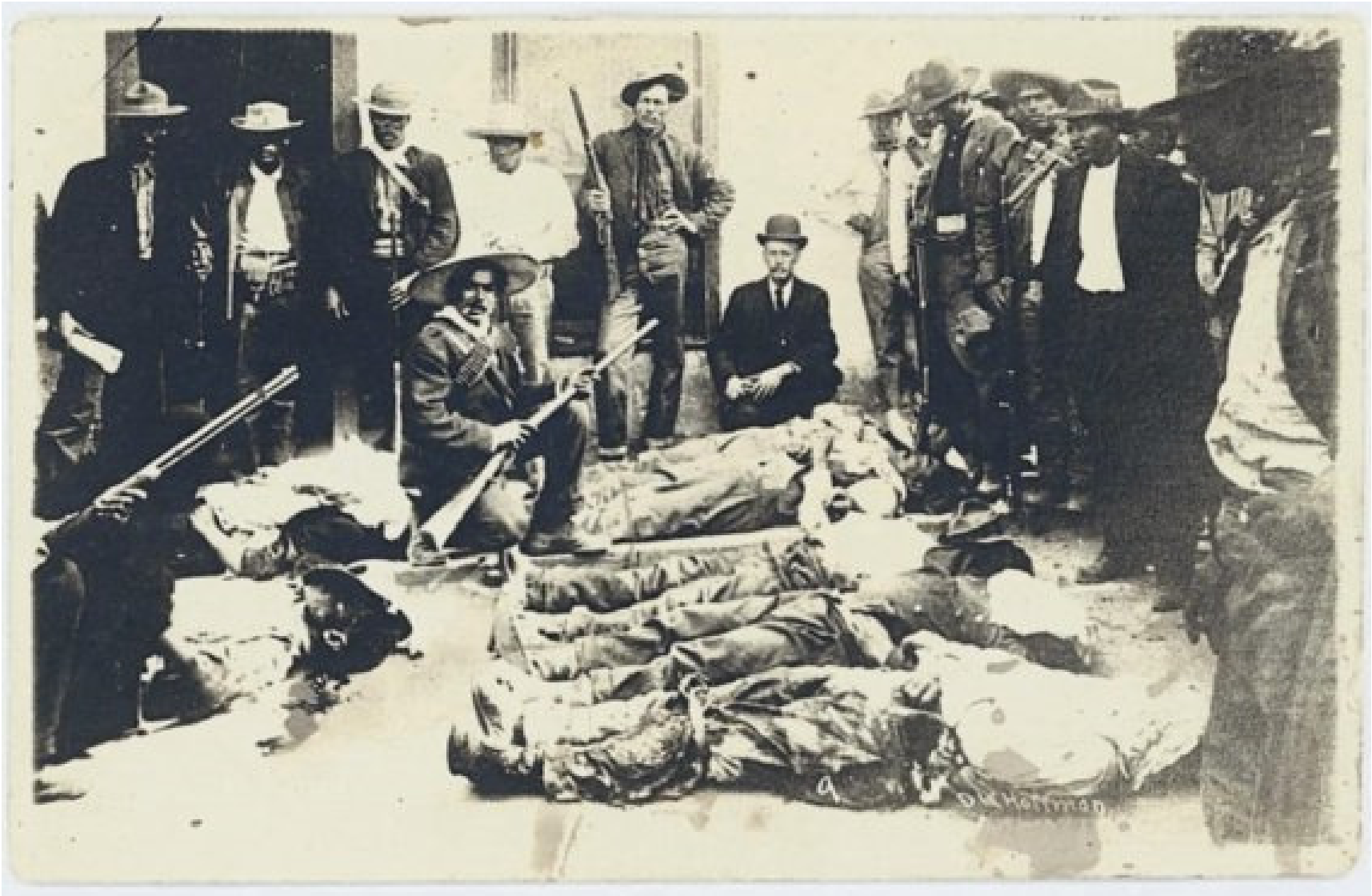
Photo purporting to show Maderistas with dead bodies at the time of the massacre, featured in El Universal, 'The Dark Side Of The Revolution: The Massacre Of Chinese People In Mexico' https://www.eluniversal.com.mx/english/dark-side-revolution-massacre-chinese-people-mexico