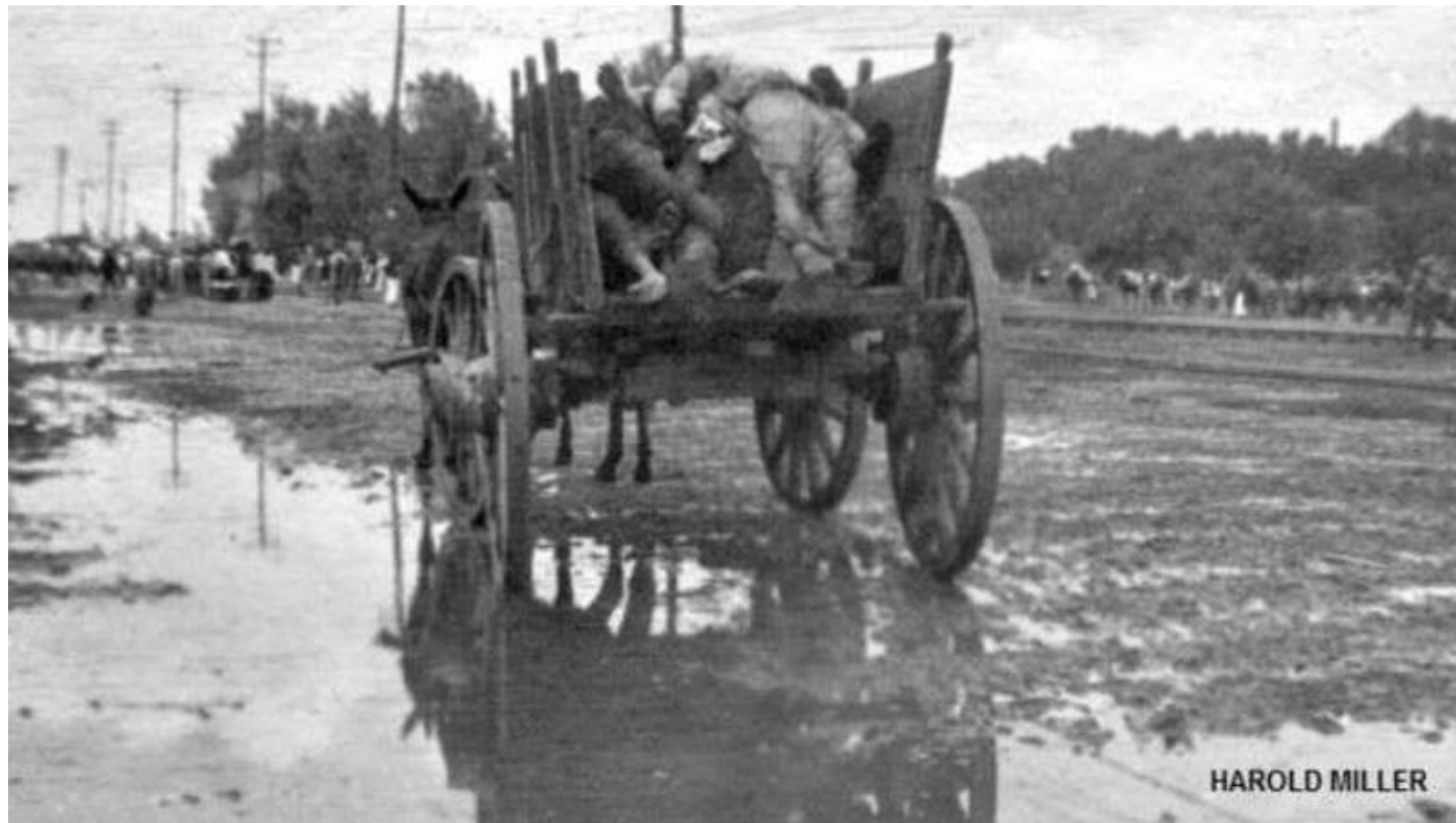
Cart carrying dead bodies of the Chinese