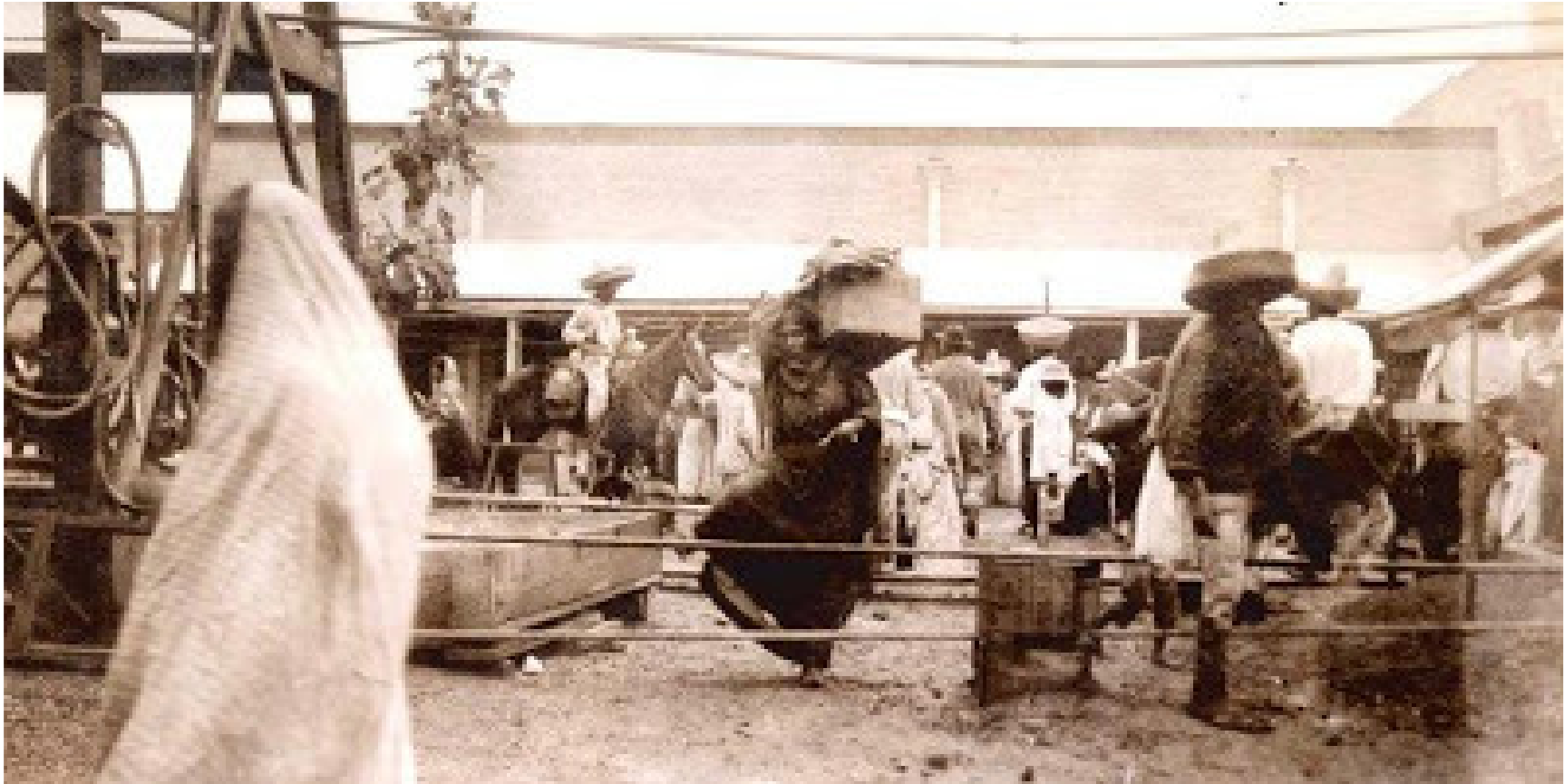
Photo purporting to show Torreón locals looting the Chinese after the Maderistas entered the city, featured in Crónica de Torreón 'Discriminación en La Laguna: las ligas "Pro Raza"' https://cronicadetorreon.blogspot.com/2009/03/discriminacion-en-la-laguna-las-ligas.html