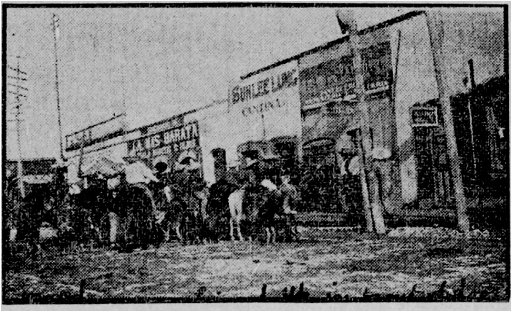
Chinese lined up in front of a door, anonymous photo from the Salt Lake Tribune, Wednesday Morning, May 31, 1911