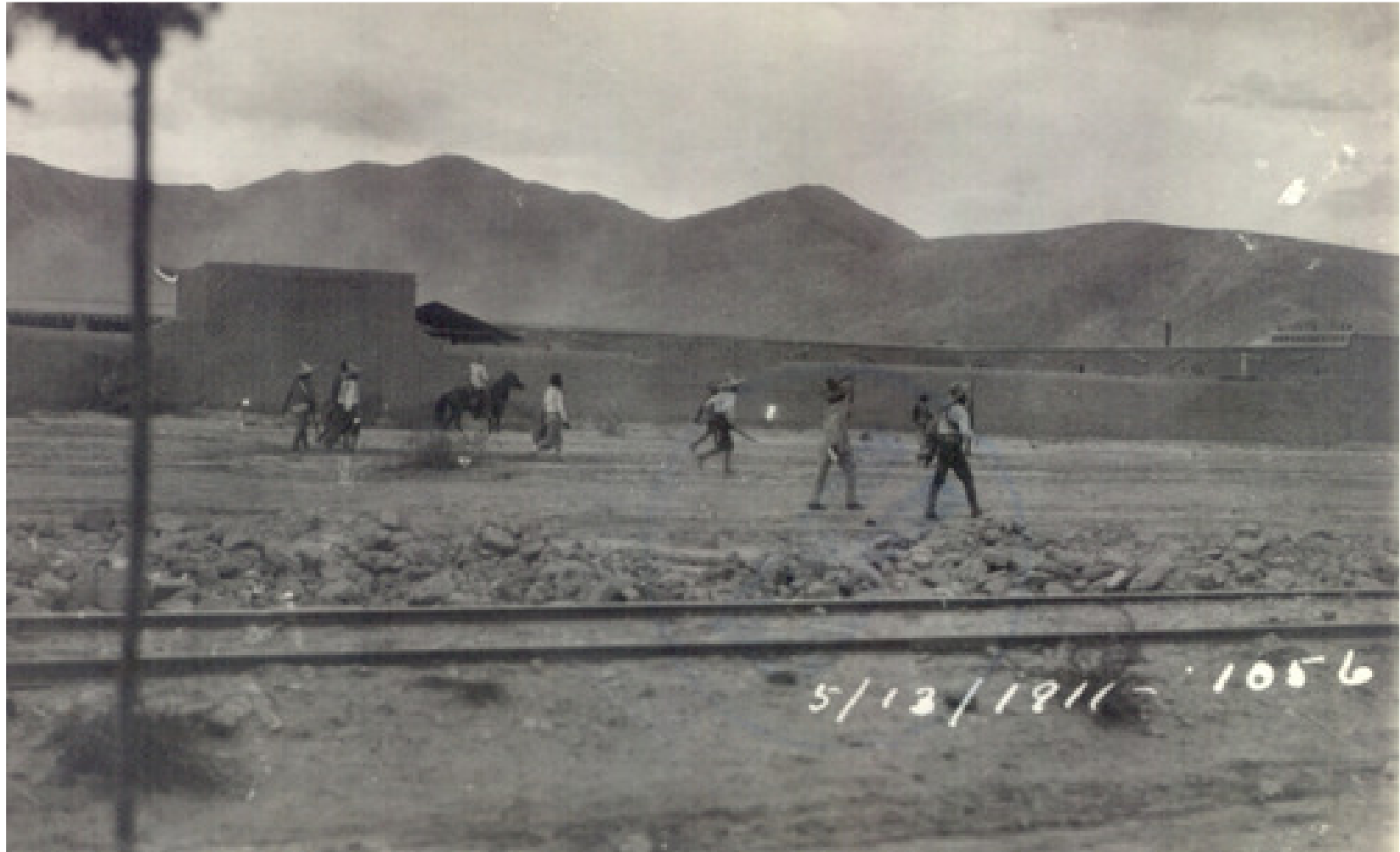
Revolutionary soldiers entering Torreon on May 13, 1911