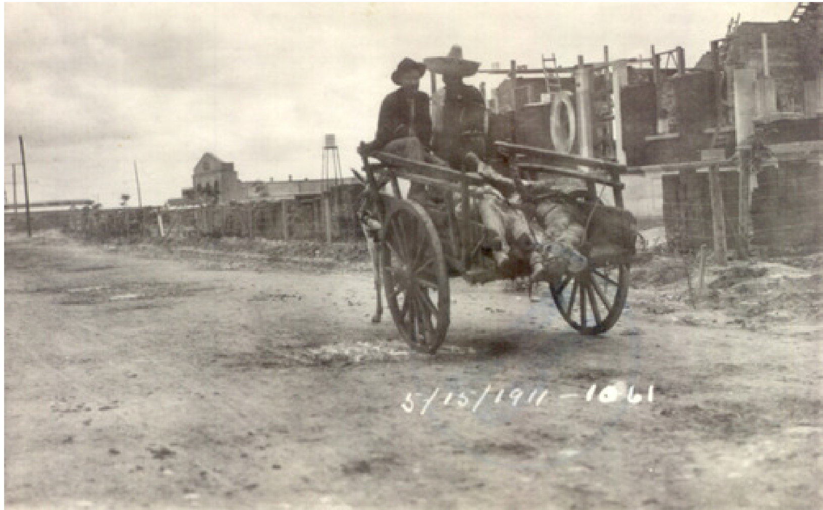
Cart carrying dead bodies, perhaps Chinese, on May 15, 1911