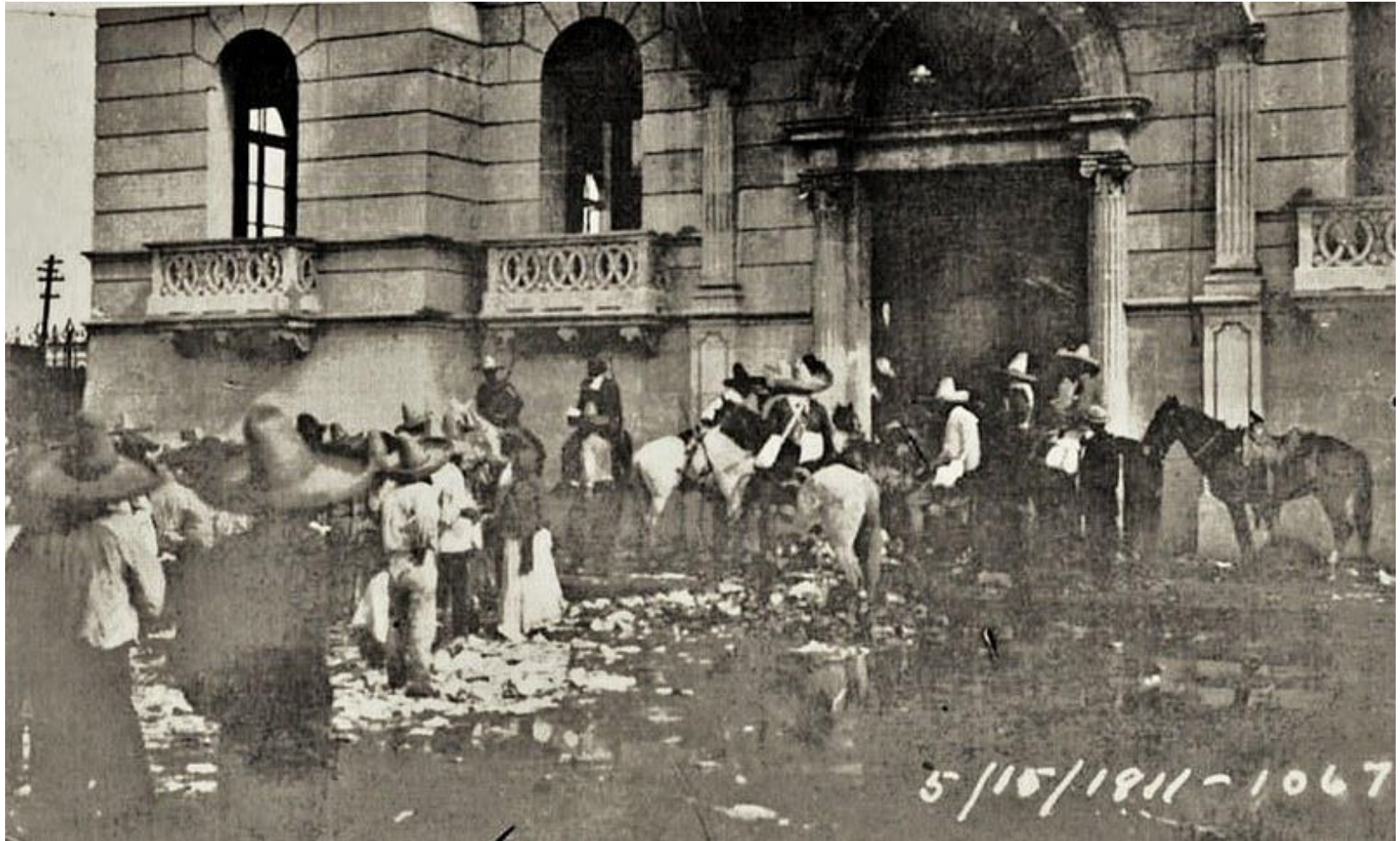
Revolutionary soldiers standing outside of the Casino de la Laguna building, which clearly seems to have been looted on May 15, 1911