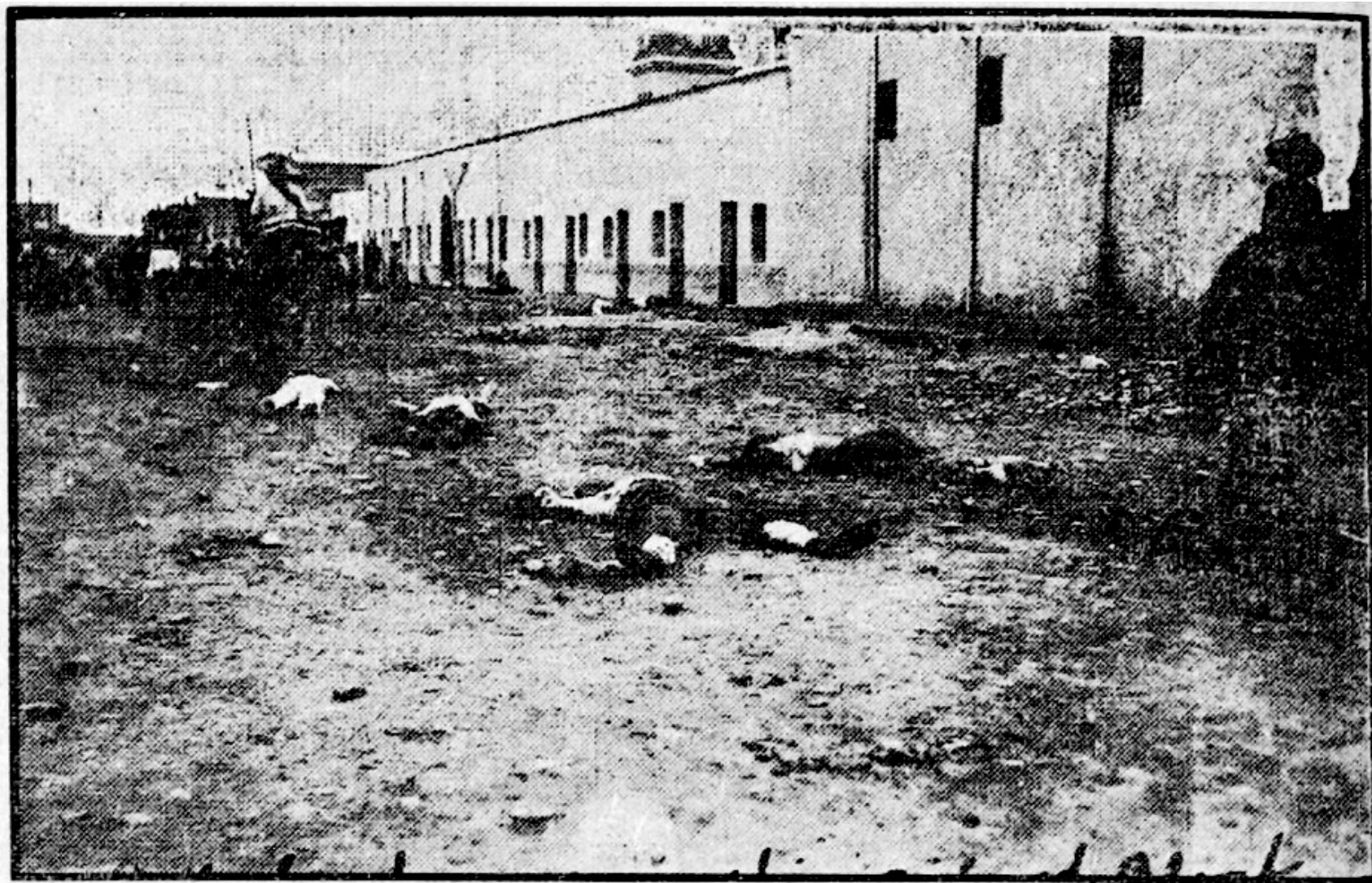
Photo taken on a street with 24 dead bodies, anonymous photo from the Salt Lake Tribune, Wednesday Morning, May 31, 1911